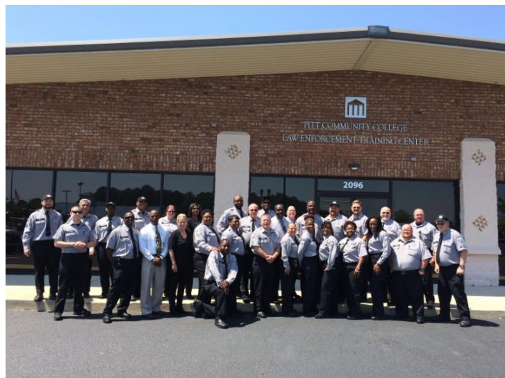
DPS Corrections CIT Graduates April 21, 2017