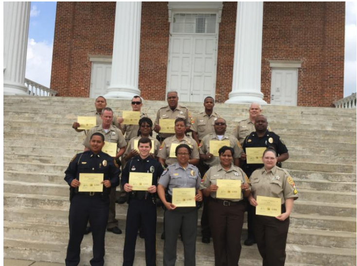
Northampton County CIT Graduates April 28, 2017