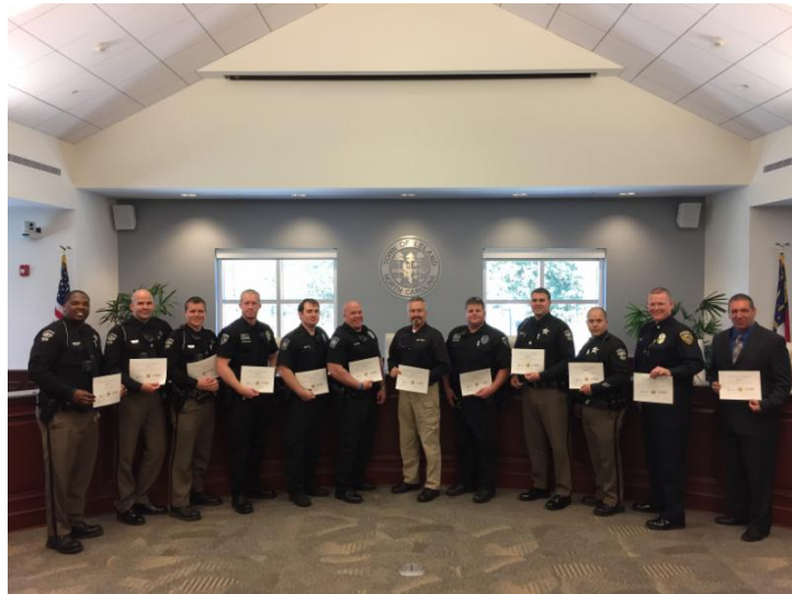
Brunswick County CIT Graduates April 4, 2017