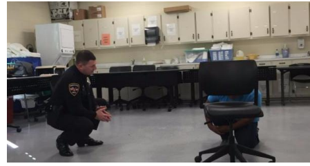
Image from a Role Play in Martin County

Have you participated in one of our CIT trainings and want to give back?