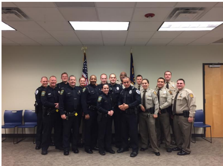
New Hanover & Brunswick County CIT Graduates