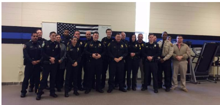
Martin County CIT Graduates