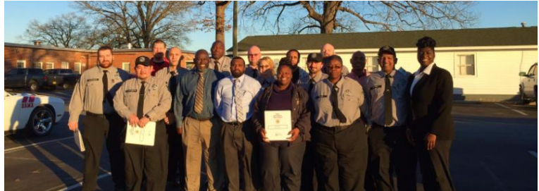
First DPS Corrections Instructor Course Graduates