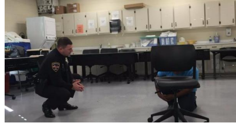
Image from a Role Play in Martin County

Become a CIT instructor yourself, participate in role plays, instruct an education session, or recruit colleagues to sign up for training.