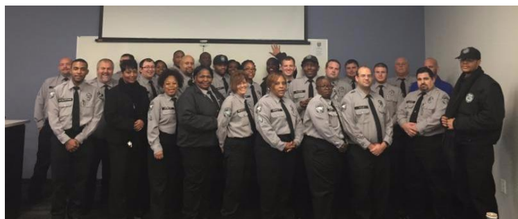
DPS Graduates Photo