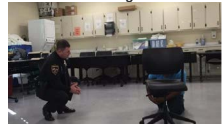
Image from a Role Play in Martin County

Become a CIT Law Enforcement partner, participate in role plays, instruct an education session, or recruit colleagues to sign up for training. Contact us to discuss the best fit for you: CIT@TrilliumNC.org