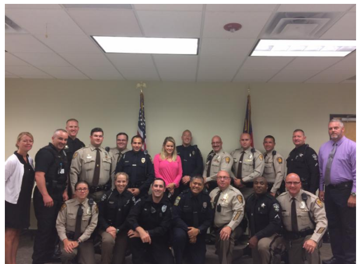
New Hanover County CIT Graduates July 28, 2017