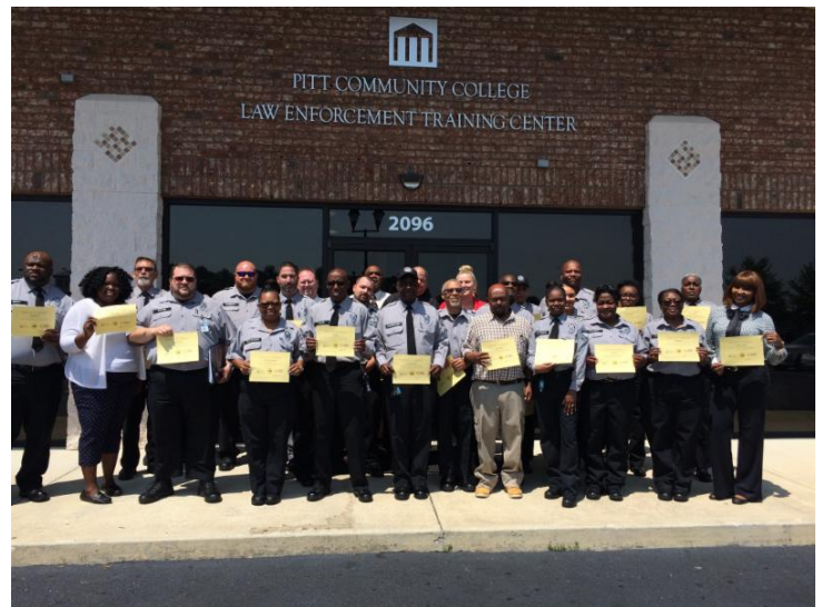
DPS Corrections CIT Graduates July 21, 2017