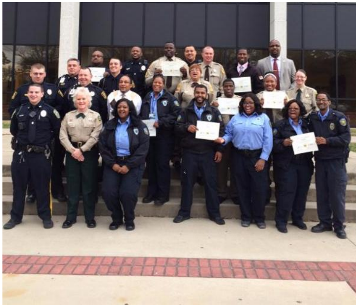
Hertford County CIT Graduates March 10, 2017