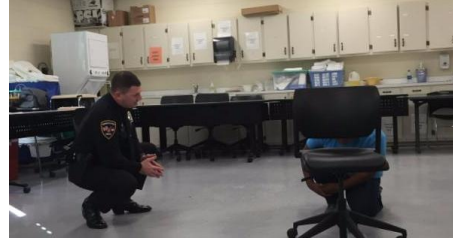
Image from a Role Play in Martin County

Become a CIT Law Enforcement partner ,participate in role plays, instruct an education session, or recruit colleagues to sign up for training. Contact us to discuss the best fit for you: CIT@TrilliumNC.org