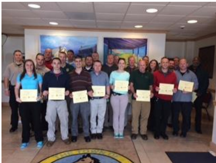
Dare County CIT Graduates February 24, 2017