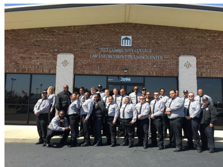
DPS Corrections Graduates March 24, 2017