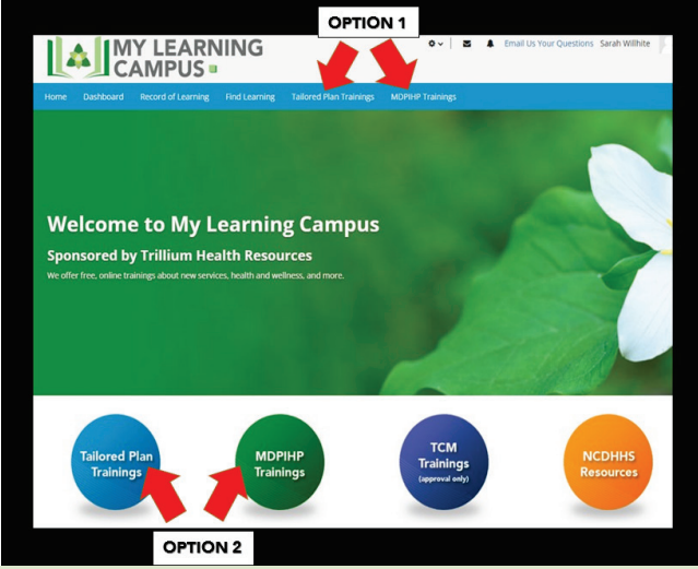
Trillium - Network Communication Bulletin #273

These two additional options will enhance the Learner experience. Providers will continue to see assigned trainings on their Dashboard and access Find Learning to review our extensive catalog of Provider Trainings. It is important to note, that some Provider Trainings require approval to access, if