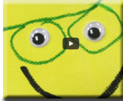
Video - Easterseals UCP 2017 Empower Summer Camp

Trillium partnered with Easterseals UCP and Autism Society of NC to provide summer camp opportunities to individuals with limited abilities. As a result of this initiative, 351 members and 28 siblings gained valuable social and recreational experiences.