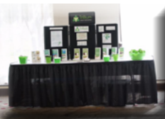
2017 Transforming Lives Awards-Greenville