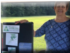
Pitt County Overdose Awareness Event