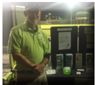
Lights of Hope Event - Greenville

Over the past quarter Trillium participated in community events and provided feedback at speaker forums throughout eastern North Carolina. Pictured below are just a few events Trillium attended. Select the image to learn more.