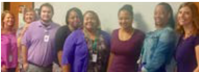
Pictured: Trillium's Call Center Staff

100% of the proceeds were donated to each teams charity of choice - Alzheimer's of NC , Restore One , American Cancer Society , and PGA Reach .